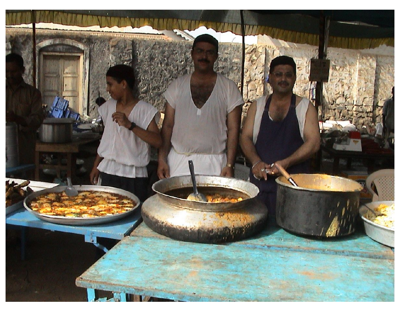
Petit Pangat in Udvada