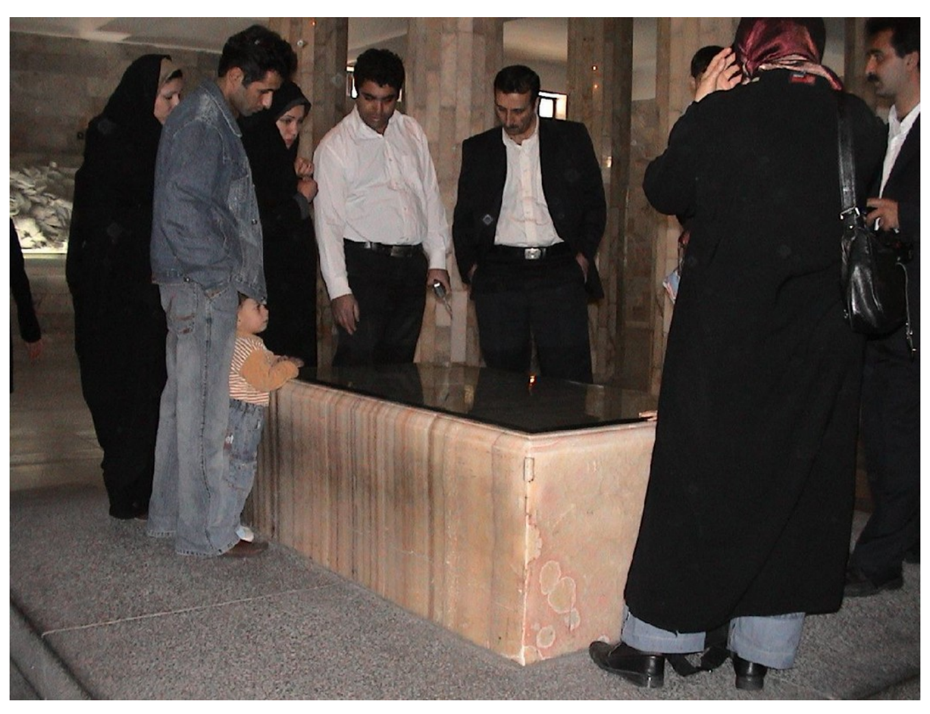
Shahnameh Opening Lines