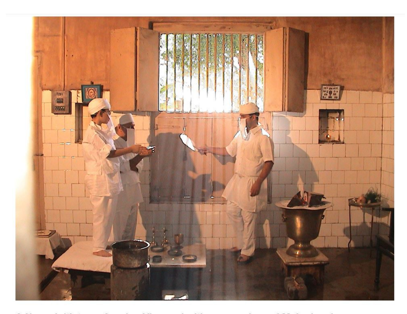
A Navar Initiate performing Visperad with an experienced Mobed and a Rāthwi.