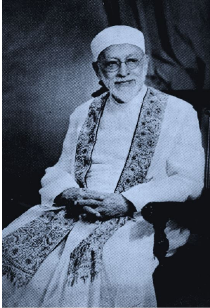
Ushtaa No Zaato Aathrava.