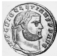
Diocletian CE 284-305

* CE 302: Remaining in constant ill health after the injury, he abdicated in favor of son, Hormazd II