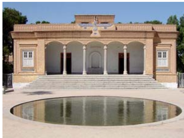
The Yazd Atash Behram, Iran