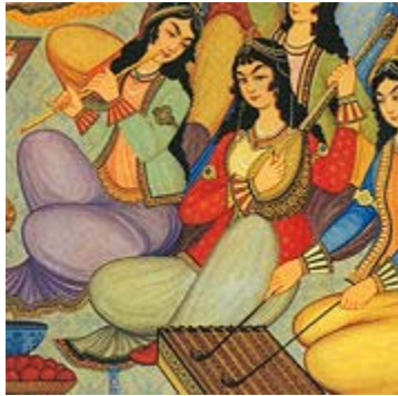
Painting of Iranian female musicians from Hasht-Behesht Palace ("Palace of the 8 heavens"), Isfahan , Iran, dated 1669

Women are not cattle Nor are they men's chattel They possess a different Kind of mettle Nor are they frail They are tough as nails Should be treated With Respect & Dignity As they are endowed With Wisdom Patience & Nobility