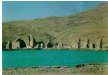
The remains of Adur Gushnasp, one of the Fire-Temples of ancient Persia

May the sweet souls Of the dearly departed Rest in eternal peace Free from misery & disease They have gone to a better place Under the care of Ahura Mazdas' Grace!