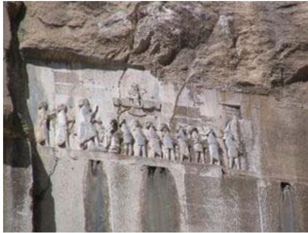
The Behistun Inscription

It seems Zoroastrianism Is like Oligarchy Ruled only by a few Spreading the Divine Message Rests solely with you