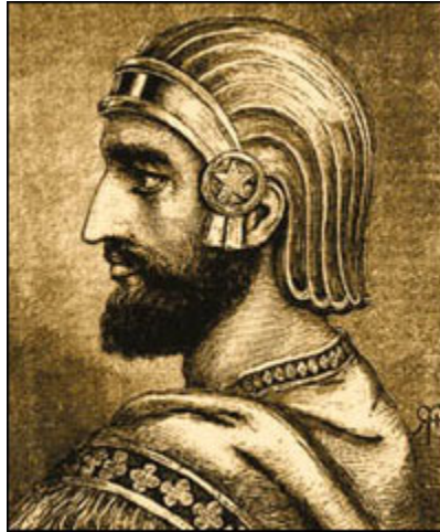
Cyrus II of Persia King of Persia; King of Media

"O man, whoever thou art, from where so ever thou cometh, for I know you shall come, I am Cyrus, who founded the empire of the Persians. Grudge me not, therefore, this little earth that covers my body" www.wikipedia.com )