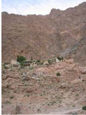
Chak Chak in Iran

With a magic like thee Your laughter like Pealing bells Thy presence was a Source of Joy to me!