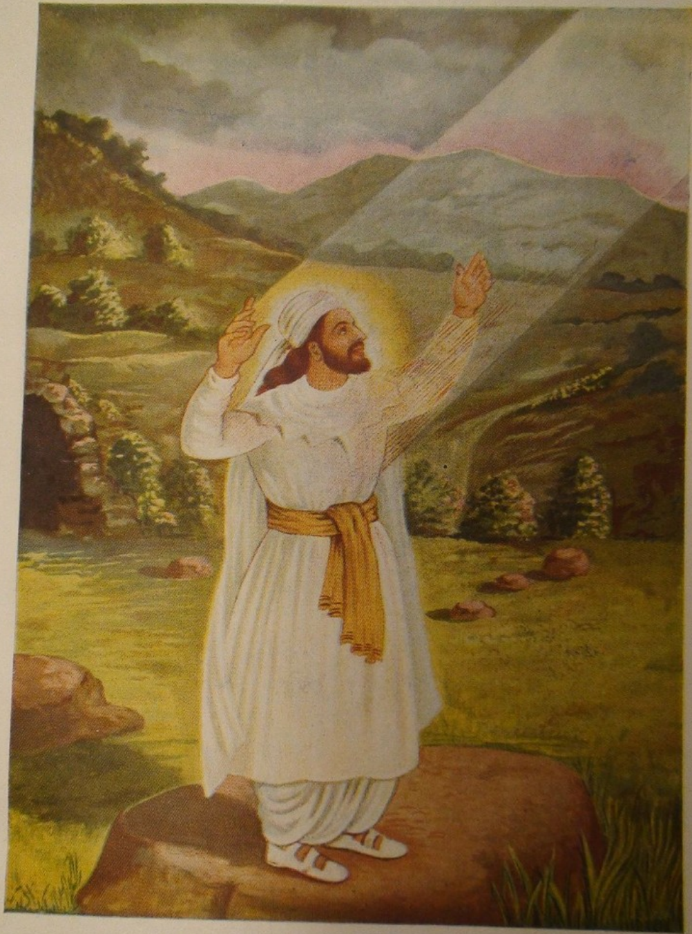
Heavenly Light descends on Zarathushtra on the Mount