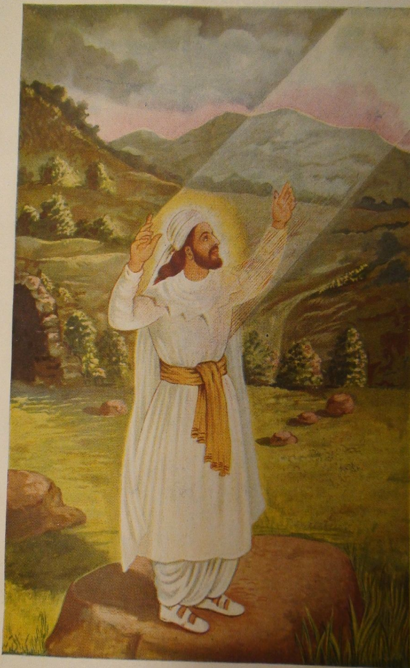
Heavenly Light descends on Zarathushtra on the Mount