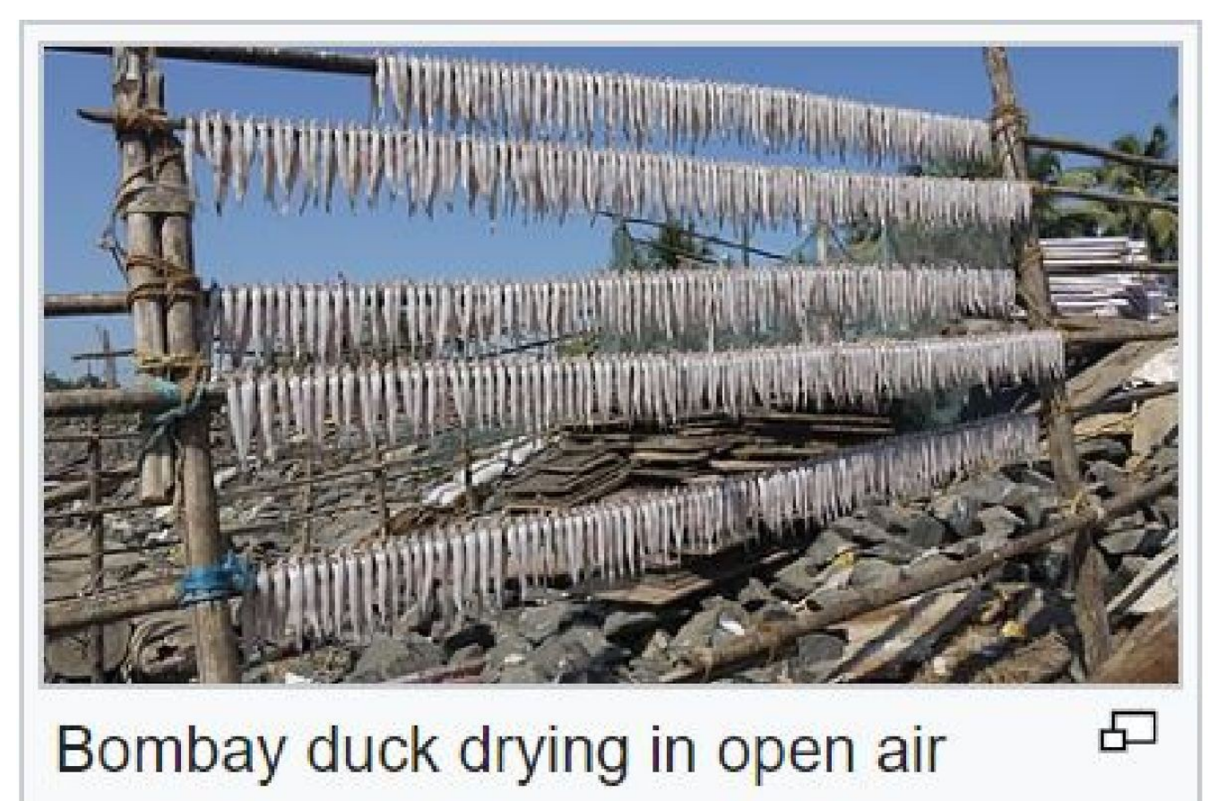
Bombay Ducks drying on scaffoldings 002.JPG_s.jpg