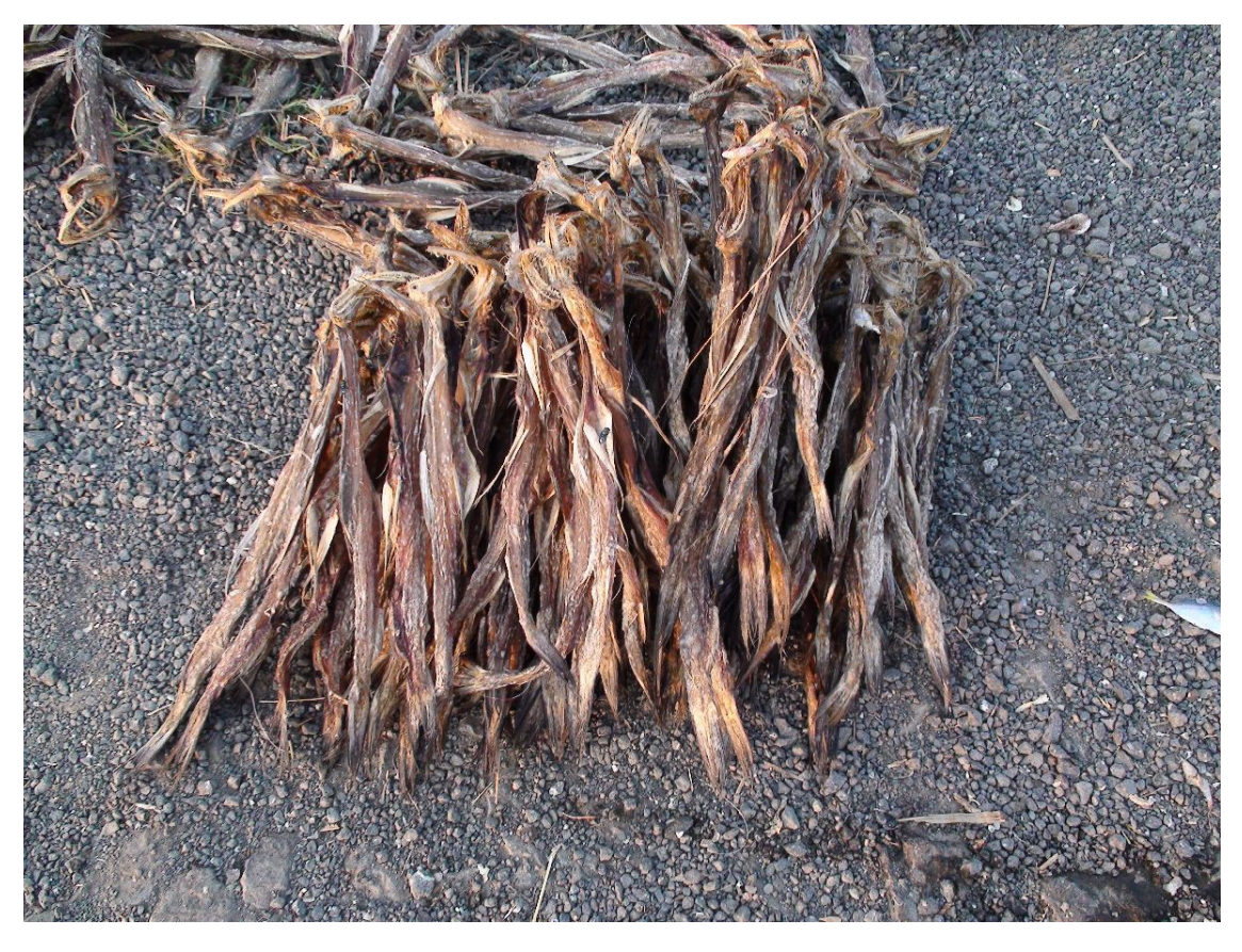
Bombay Ducks drying on scaffoldings 004.JPG_s.jpg