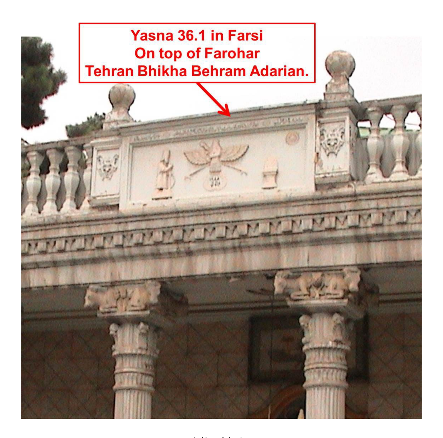
Inside an Agiary.jpg