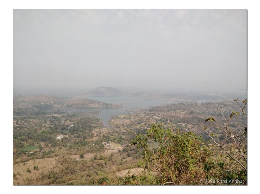
004 Ajmalghad Jashan.jpg