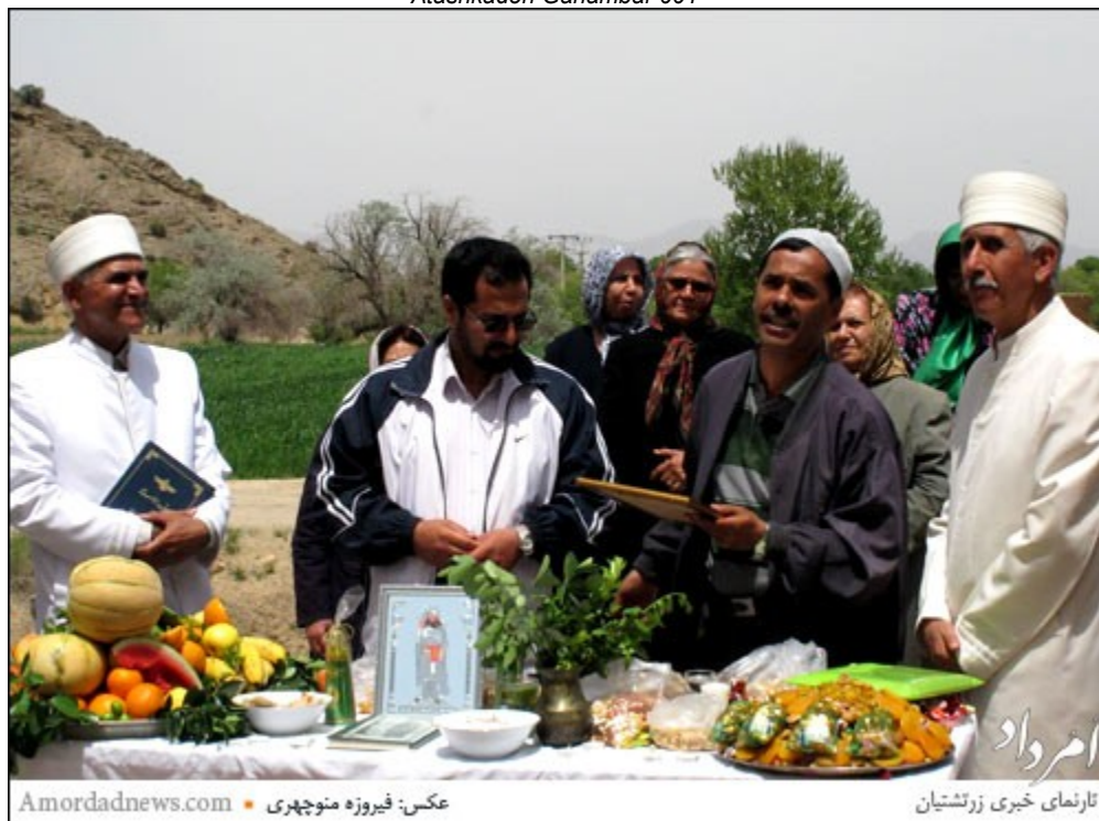
Atashkadeh Gahambar 002